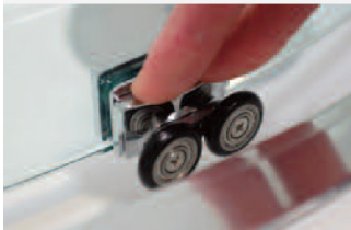
STAINLESS STEEL DOUBLE ROLLERS - QUICK RELEASE DESIGN