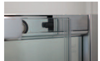
MAGNETIC CUSHION CLOSE DOOR SYSTEM