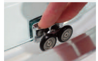
STAINLESS STEEL DOUBLE ROLLERS - QUICK RELEASE DESIGN