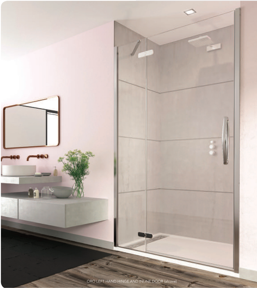
ORO LEFT HAND HINGE AND INLINE DOOR (alcove)